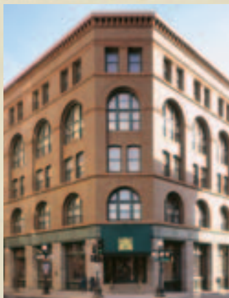
THE GOTZIAN SHOE COMPANY - SAINT PAUL

The Parkside is one of the most perfectly unique residential buildings in all of St. Paul. Its impressive history dates back to 1913, when prominent architect Cass Gilbert (designer of the U.S. Supreme Court Building in Washington, D.C., the famed Woolworth Building in New York, as well as Minnesota's own beaux arts masterpiece, the State Capitol Building) was hired by the old Gotzian Shoe Company to design a new home for its growing shoe manufacturing business.